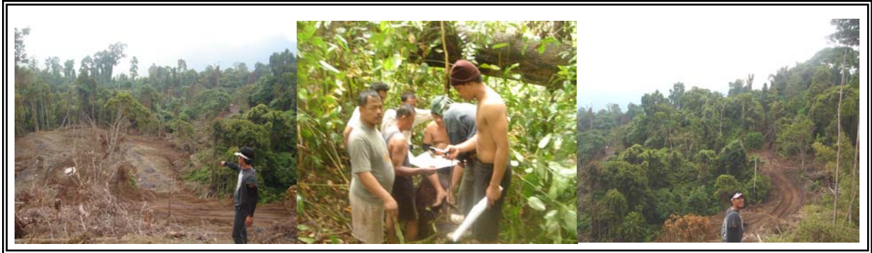
Above are some Photos taken during the conduct of perimeter survey