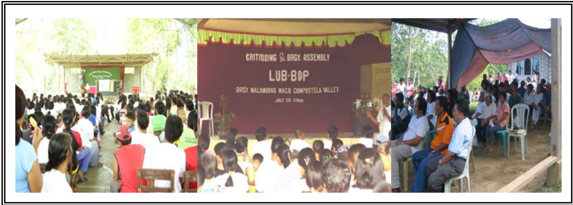
Above are some Photos taken during the conduct of the Barangay assemblies for presentation of the identified land use based-programs and projects