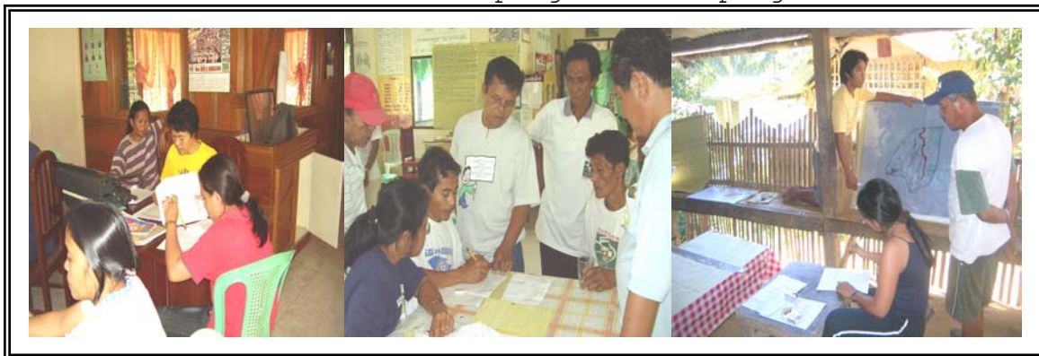
Above are some Photos taken during the conduct of the Actual Data Gathering