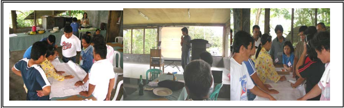
Above are some Photos taken during the conduct of refresher course last June 28-30, 2006