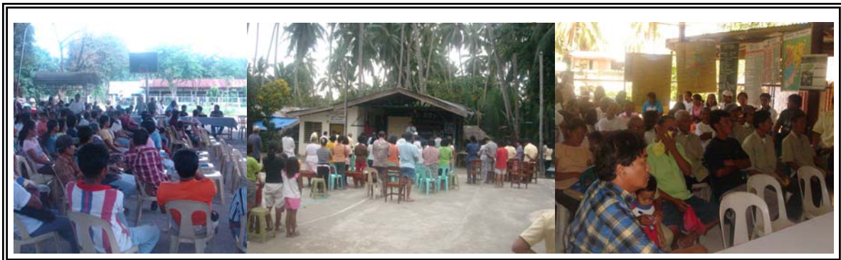
Above are some Photos taken during the conduct of the Barangay assemblies for presentation of the identified land use based-programs and projects